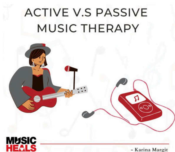
Figure 1. Direct Difference between Active MT and Passive MT.

Music is the art of time with organized sound movement, with a fixed period of time covering changes in melody and rhythm. People have tried for a long time to find the relationship between music and people's inner world. Music Therapy (MT) is a systematic process in which the music therapist uses various forms of musical experiences, as well as the therapeutic relationships that develop as the driving force of therapy to help the patient achieve health goals. It can be divided into two types according to the participation form of the client: active and passive. As shown by figure 1, the active MT discussed in this paper mainly adopts singing, instrumental performance, composition, lyric creation, and improvisation, while in passive MT, clients listen to, discuss and accept musical stimulation. It has been proven to be effective for clients with neurological disorders (Canicio, Guardiola, and Moreno 2017; Raglio et al. 2015) and autism spectrum disorder (Foley 2017; Gold, Wigram, and Elefant 2006). For example, in September 2022, I established a MT club in my school and held some MT courses for 7 autistic children. Through singing their favorite songs with them and teaching them to play kalimba, I noticed their increased engagement and willingness to speak.